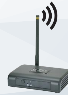
LPLUS Internet Gateway