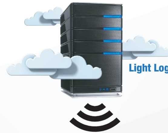
Light Logic™ Internet Server