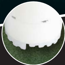
Ratcheting height adjustment