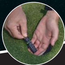
Water resistant quick connect