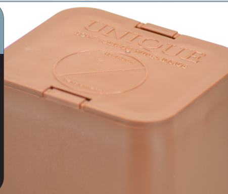
Intelli-HUB Part # INTELLIHUB

Dimensions Height: 8.52" (216.408 mm) Diameter: 6.03" (153.162 mm)