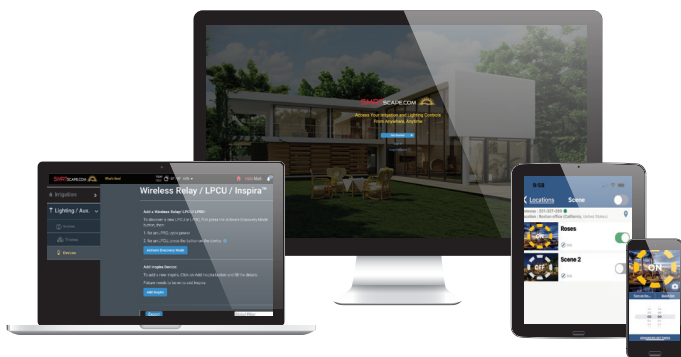
SMRTSCAPE compatible, app controlled