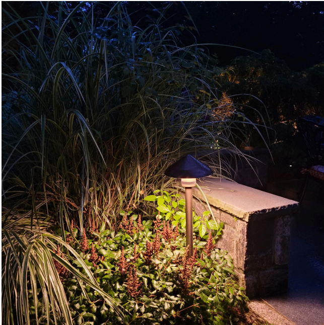
INSPIRA Van Gogh fixture

Lighting up your home should be fun! Make it your own with the numerous stylish fixtures Unique Lighting Systems offers, such as Inspira® fixtures, which will give your design a high-end look with their premium grade solid brass and composite material. Plus, the SMRTSCAPE™ cloud connection allows you to customize the color, beam angle and brightness based on the time of year or for a special occasion. The sky is the limit for lighting options!