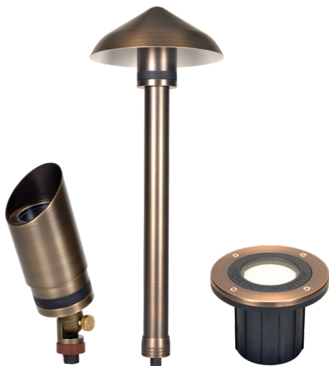
Premium grade INSPIRA Fixtures

Lighting up your home should be fun! Make it your own with the numerous stylish fixtures Unique Lighting Systems offers, such as Inspira® fixtures, which will give your design a high-end look with their premium grade solid brass and composite material. Plus, the SMRTSCAPE cloud connection allows you to customize the color, beam angle and brightness based on the time of year or for a special occasion. The sky is the limit for lighting options!