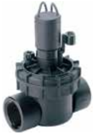
1" In-Line Jar-Top Valve with Flow Control (Threaded) 53709