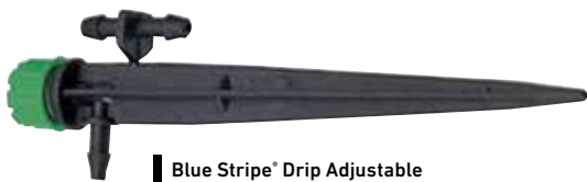
Blue Stripe® Drip Adjustable Flow Stream Emitter with Stake 53800