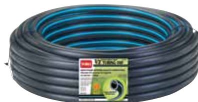
Blue Stripe® Drip 1/2" Tubing, 50', 100', 500' 53719, 53605, 53616