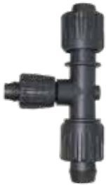
Blue Stripe® Drip 1/2" Tee 53170