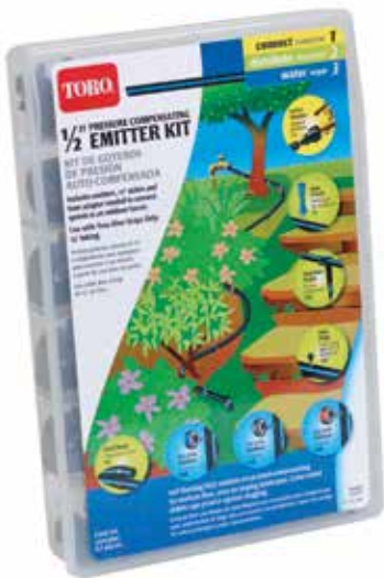
Blue Stripe® Drip 1/2" Emitter Kit 53619