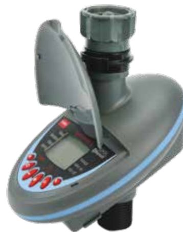
Bluetooth Hose-End Timer 53454