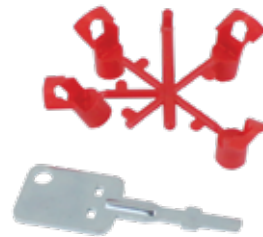
Mini-8 Nozzle Tree/Adjustment Tool 53924