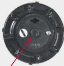
Arc setting is visible from the top of the sprinkler