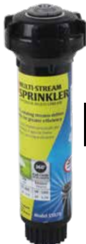
Multi-Stream Lawn Sprinkler (Full) 53878