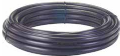
50' and 100' Roll of Funny Pipe® 53186, 53338