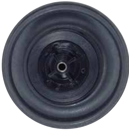
Jar-Top Valve Diaphragm 53804