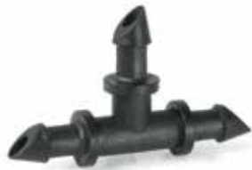
Blue Stripe® Drip 1/4" Tee 53636