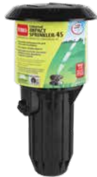
Universal Impact Sprinkler-45 53721