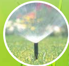
570 MPR+ NOZZLES WITH PRESSURE COMPENSATION