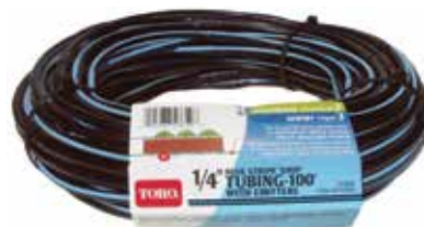
Blue Stripe® Drip 1/4" Tubing, 100' 53639