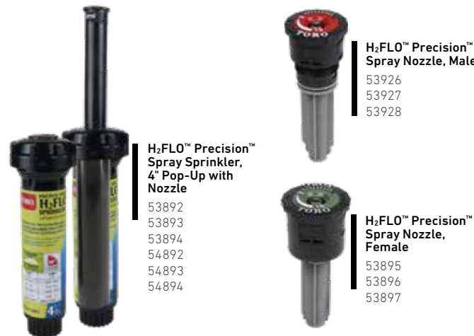
H 2 FLO™ Precision™ Spray Sprinkler, 4" Pop-Up with Nozzle 53892 53893 53894 54892 54893 54894