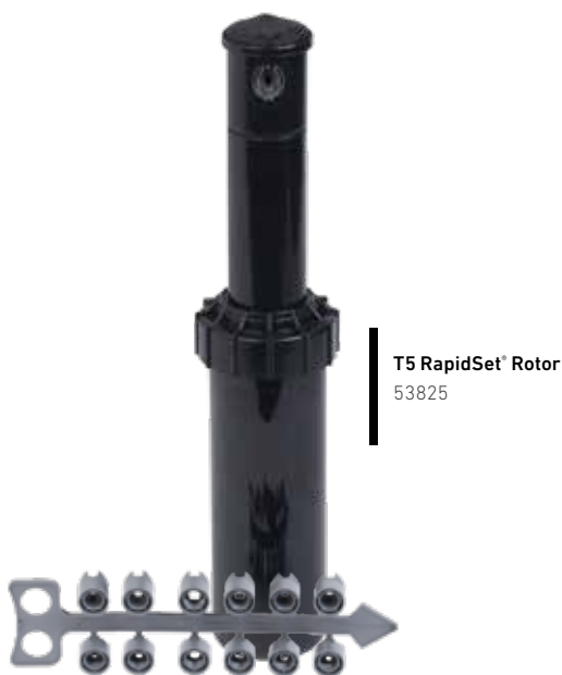
T5 RapidSet® Rotor 53825