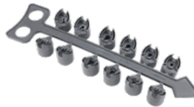
ProStream XL™/ T5 Nozzle Tree 53923