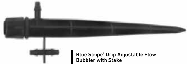
Blue Stripe® Drip Adjustable Flow Bubbler with Stake 53836