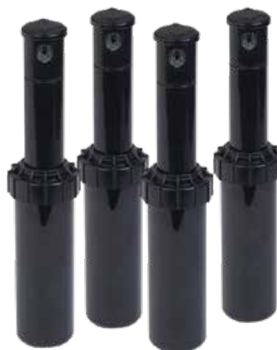
T5 Rotor (4-Pack) 53826