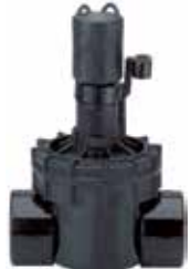
1" In-Line Jar-Top Valve with Flow Control (Slip) 53707