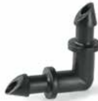
Blue Stripe® Drip 1/4" Elbow 53635