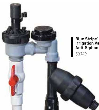
Blue Stripe® Drip Irrigation Valve Kit, Anti-Siphon 53749