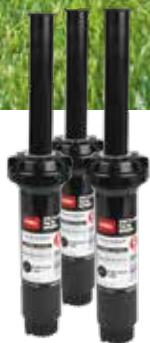
570 Pro Series Spray Sprinklers