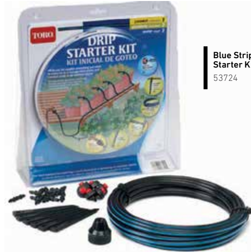
Blue Stripe® Drip Starter Kit 53724