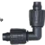
Blue Stripe® Drip 1/2" Elbow 53169