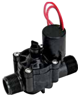
3/4" In-Line Valve 53380