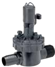
1" In-Line Jar-Top Valve with Flow Control (Male NPT x Barb) 53799