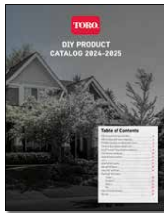
Toro DIY Catalog 2024-2025 Available to download online www.toro.com/diy