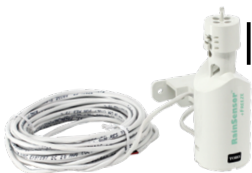
Wired Rain/Freeze Sensor 53853