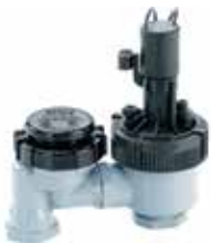
Anti-Siphon Jar-Top Valve with Flow Control (Threaded) 53763 53764