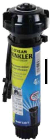
Multi-Stream Lawn Sprinkler (Adjustable) 53877