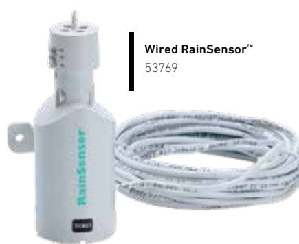
Wired RainSensor™ 53769