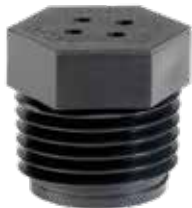
Drain Valve 53740