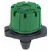
Blue Stripe® Drip Adjustable Emitter 53681