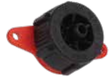
Blue Stripe® Drip 2.0 GPH Pressure Compensating Emitters 53690