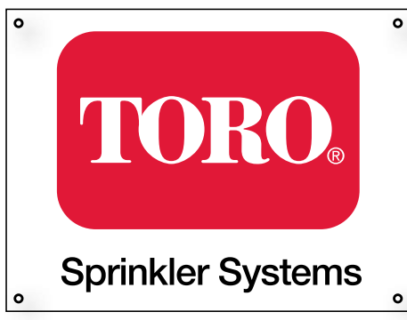
Toro 4' x 3' Vinyl Banner 53280