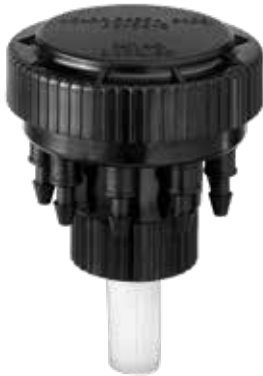
Blue Stripe® Drip 9-Outlet Distribution Manifold 53755