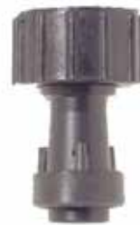
Blue Stripe® Drip 1/2" Hose Swivel Adapter 53701