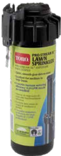
ProStream XL™ Lawn Sprinkler 53823