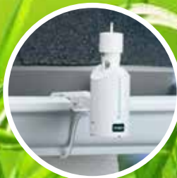
RAINSENSOR™ RAIN/FREEZE SENSOR