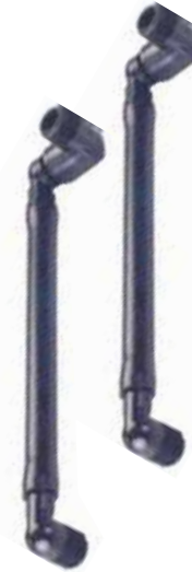
1/2" and 3/4" Funny Pipe® Sprinkler Flex Assemblies 53784, 53785