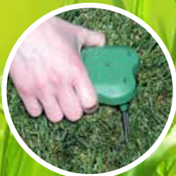
PRECISION™ SOIL MOISTURE SENSOR