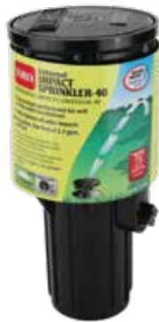
Universal Impact Sprinkler-40 53720