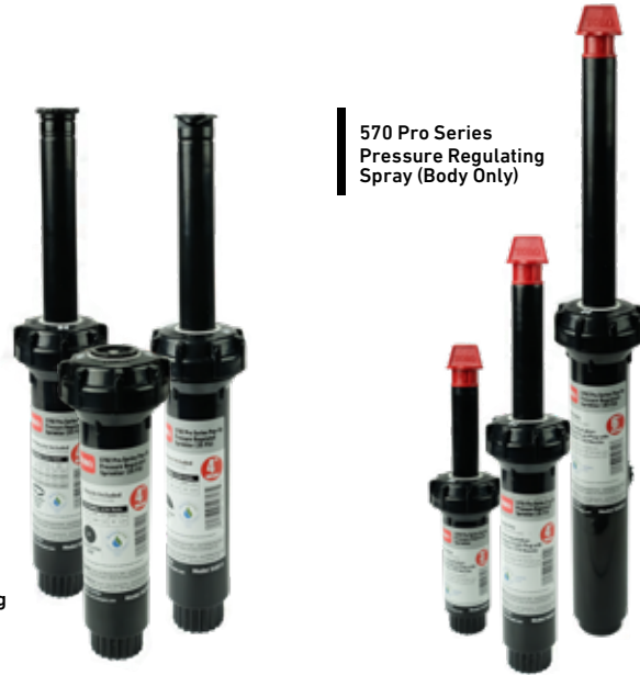
570 Pro Series Pressure Regulating Spray (Body Only)