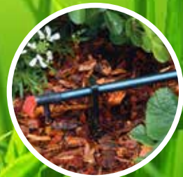
BLUE STRIPE™ DRIP PRODUCTS