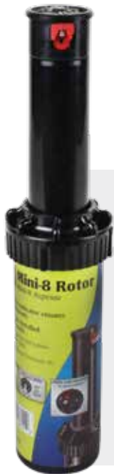
Mini-8 Rotor 53824