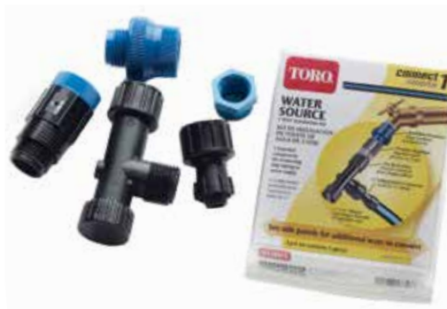
Blue Stripe™ Drip Water Source Installation Kit 53756