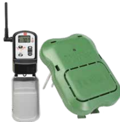
XTRA SMART® Precision™ Soil Moisture Sensor 53812