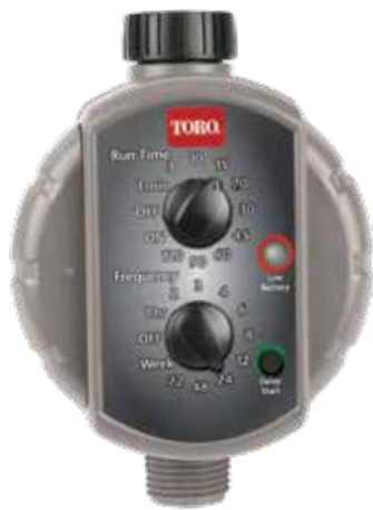
Low-Pressure Tap Timer 53453