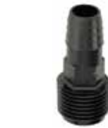
3/4" Male Adapter 53389