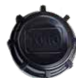
570 Plug Cap 53504