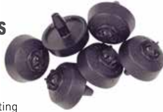
Blue Stripe® Drip 1.0 GPH Pressure Compensating Emitters 53621