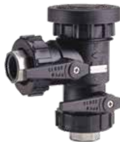
1" Pressure Vacuum Breaker 53300