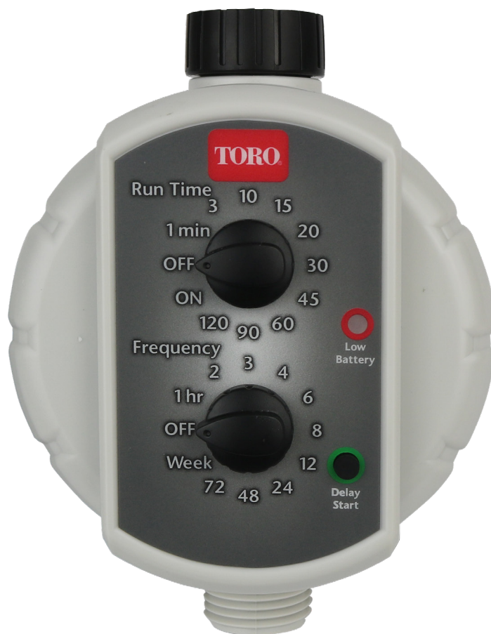
Low-Pressure Tap Timer 53453

Red indicator light alerts you when it's time to change batteries.