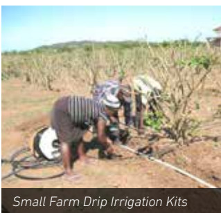
Small Farm Drip Irrigation Kits