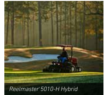
Reelmaster 5010-H Hybrid