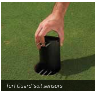
Turf Guard® soil sensors