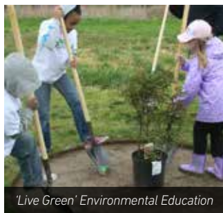
'Live Green' Environmental Education