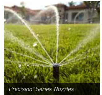
Precision™ Series Nozzles