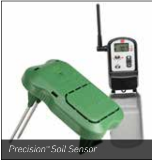
Precision™ Soil Sensor