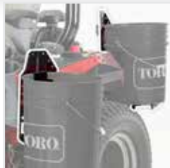
BUCKET HOLDER KIT AND TRASH PICKER MOUNT