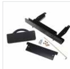
WEIGHT KIT Available Spring 2017