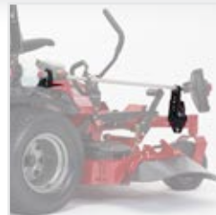
TRIMMER MOUNT KIT