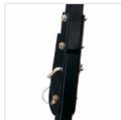
ROPS PIN KIT