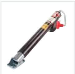
DECK MAINTENANCE JACK