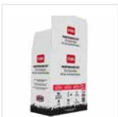
MAINTENANCE KIT Available Spring 2017