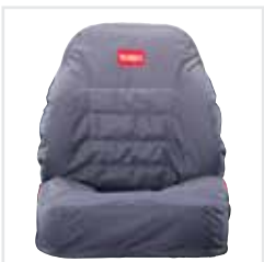
HIGH BACK SEAT COVER Available Spring 2017