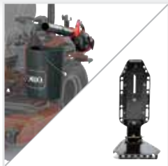
UNIVERSAL MOUNT KIT