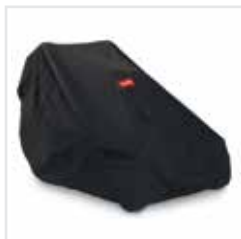
TORO DELUXE LARGE Z COVER