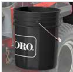
TORO 5 GALLON BUCKET