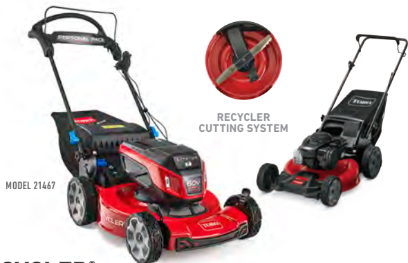
RECYCLER CUTTING SYSTEM