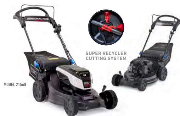
SUPER RECYCLER CUTTING SYSTEM

Push, self-propel rear wheel drive and Personal Pace ® Auto-Drive rear-wheel drive options available