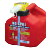
NO SPILL® FUEL CANS