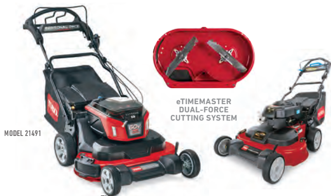
eTIMEMASTER DUAL-FORCE CUTTING SYSTEM

Glide over holes and bumps with ease with Toro's FLEX ™ Handle suspension