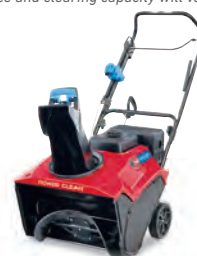
Power Clear 821 QZE 252cc Toro Premium OHV Engine Self-Propelled Power Propel® 21" / 53 cm Clearing Width