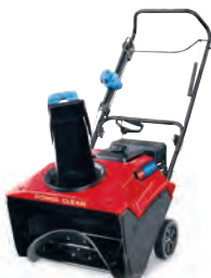
Power Clear 721 QZE 212cc Toro Premium OHV Engine Self-Propelled Power Propel® 21" / 53 cm Clearing Width

**Throw distance and clearing capacity will vary with conditions. ***See retailer for complete warranty details.