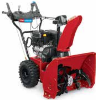
Power Max 824 OE 252cc Toro Premium OHV Engine Self-Propelled 24" / 61 cm Clearing Width

Take control of big snow jobs this winter with Power Max and Power Max HD. These two-stage snow blowers clear wide paths with speed and ease.