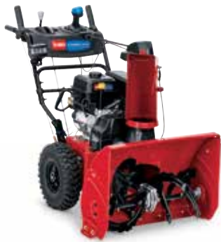
Power Max 826 OHAE Hand Warmers Standard Heavy Duty Handle Construction 26" / 66 cm Clearing Width