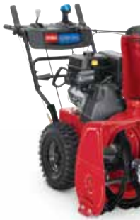
Power Max H Commercial-Grade All-Steel Constructio 16" / 40.6 cm Tires