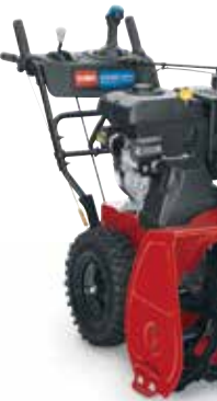
Power Max H 30" / 76 cm Clearing 302cc Toro Premium Double Deflector Hand Warmers Sta