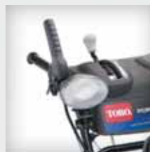
LIGHT KIT Part #116-8234