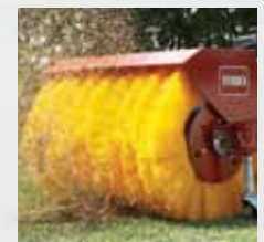
TURF BRISTLE DISCS Part #116-8233

Other Available Accessories Include: DIRT DEFLECTOR (Part #116-8229) and DEBRIS BOX (Part #116-8230)