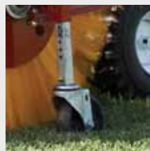
TURF CASTER Part #116-8228