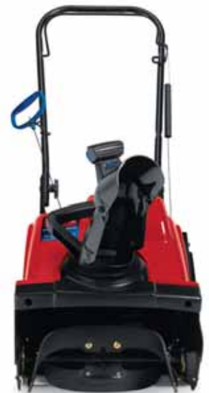
TORO POWER CLEAR® 518

As our best-selling models, Power Clear snowblowers are strong enough to take on serious snow, yet easy for anyone to maneuver. And with Toro's 2-Year Guaranteed to Start Warranty*, you're ready for whatever winter has in store. No wonder professional snow removal crews use Toro single-stage snowblowers more than any other brand or type of snowblower to help them get their job done.**