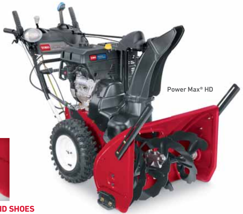
Power Max® HD

Equipped with high performance engines and commercial grade gearbox. This is the toughest model in the line to make your job easier.