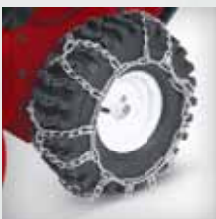
TIRE CHAIN KIT Part #107-3813