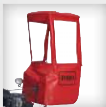
SNOW CAB KIT Part #127-5960