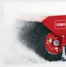
CONCRETE/SNOW BRISTLE DISCS Part #116-8232