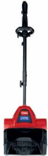
TORO® POWER SHOVEL

Toro's compact electric snowblowers are lightweight and easy to store for clearing your deck, sidewalk or patio. But don't let the compact size fool you. These models are powerful enough to throw snow up to 30 ft and clear down to the pavement. They're also maintenance-free, which means there is no gas and oil to mix. Just plug them in and go.