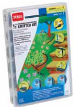
Blue Stripe® Drip 1/2" Emitter Kit 53619