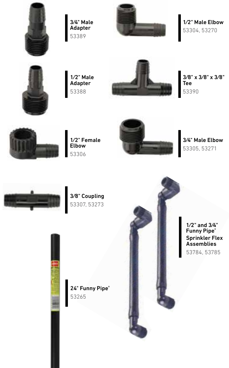
3/4" Male Adapter 53389