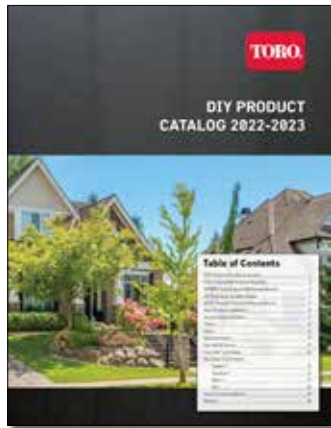
Toro DIY Catalog 2022 Available to download online www.toro.com/diy