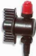
Blue Stripe® Drip Adjustable Micro-Spray Nozzle, Full Pattern 53846