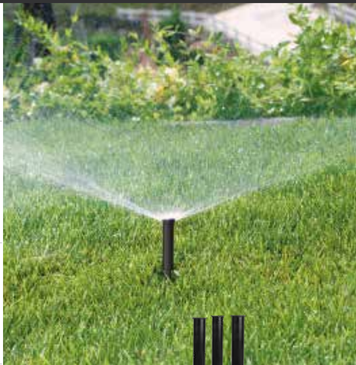
570 Pro Series Spray Sprinklers