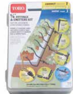
Blue Stripe® Drip 1/4" Fitting and Emitter Kit 53790