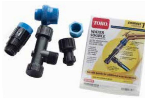
Blue Stripe™ Drip Water Source Installation Kit 53756