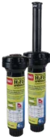
H 2 FLO™ Precision™ Spray Sprinkler, 4" Pop-Up with Nozzle 53892 53893 53894 54892 54893 54894