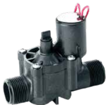
3/4" In-Line Valve 53380