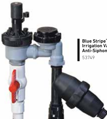
Blue Stripe® Drip Irrigation Valve Kit, Anti-Siphon 53749