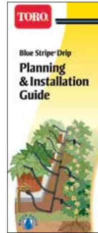
Blue Stripe® Drip Planning & Installation Guide 53850