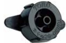
Blue Stripe® Drip 2.0 GPH Pressure Compensating Emitters 53690