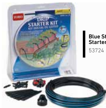
Blue Stripe® Drip Starter Kit 53724