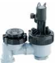
Anti-Siphon Jar-Top Valve with Flow Control (Threaded) 53763 53764