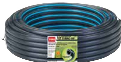
Blue Stripe® Drip 1/2" Tubing, 50', 100', 500' 53719, 53605, 53616