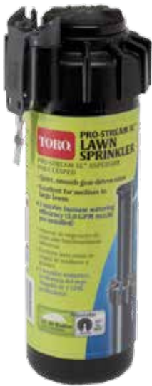
ProStream XL™ Lawn Sprinkler 53823