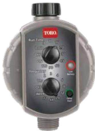
Low-Pressure Tap Timer 53453