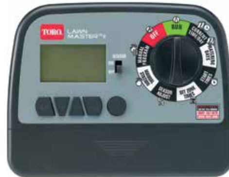
Lawn Master® II Landscape Timer 53805, 53806