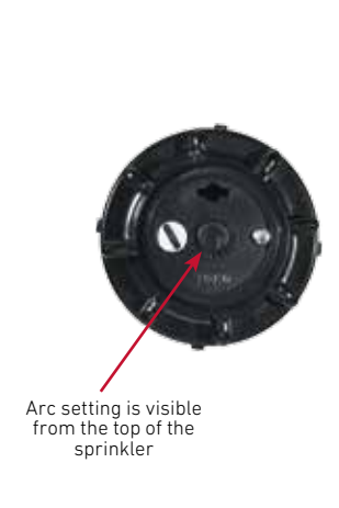
Mini-8 Rotor 53824