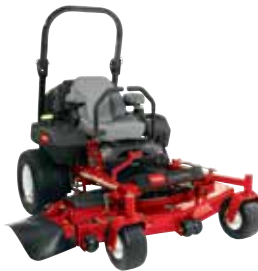
Z Master Professional 7000 Series

Professional 6000 Series models are enhanced with additional features for smooth and powerful performance, including a robust deck hanging system for a clean cut on hillsides.