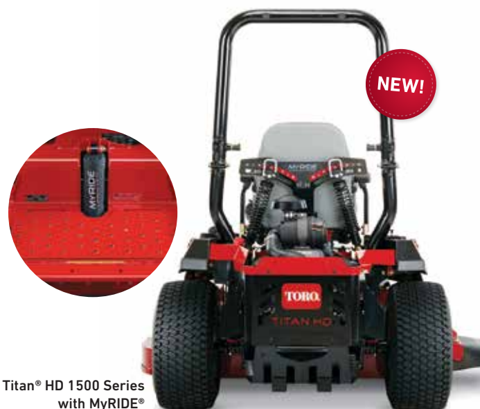
Titan® HD 1500 Series with MyRIDE®

The MyRIDE Suspension System features a suspended operator platform and adjustable rear shocks to isolate bumps and vibrations so you don't feel the rough terrain. It's the Toro toughness you expect with a ride you won't believe.