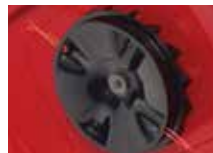
NYLON WIRE (HoverPro 400 & 450)