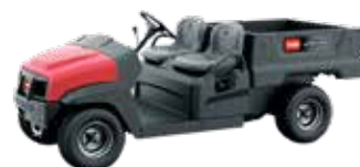
Workman GTX-D Series

Workman HD/HDX/HDX-D utility vehicles combine strength and durability with outstanding payload and towing capacity for your most demanding jobs. Many attachments are available for added versatility.