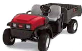
Workman® MD/MDX/MDX-D Series