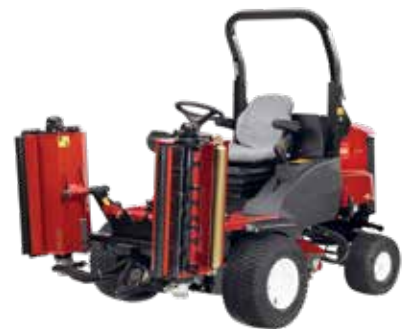
NEW LT-F3000 - Commercial Triple Flail