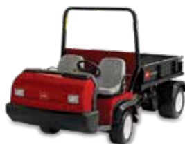
Workman HD/HDX/HDX-D Series

Workman MD/MDX/MDX-D utility vehicles enhance productivity and operator comfort with Superior Ride Quality (SRQ™) and the highest total carrying capacity in their class.