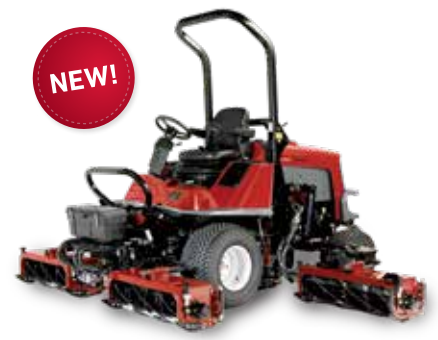
T4240 - Heavy Duty 5 Unit Mower

The LT3340 reel mower can be tailored for everything from light trimming to mowing dense, overgrown areas.