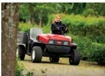
SPRAYERS / UTILITY VEHICLES 20-21

Research. We listen to grounds professionals and use their feedback to develop new solutions that help increase productivity and conserve the world's precious resources.