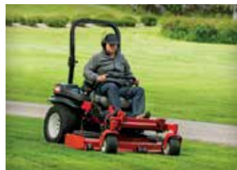
ZERO TURN MOWERS 8-9