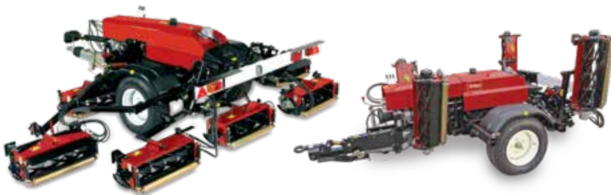
TM5490/7490 - 5 & 7 Unit Reel