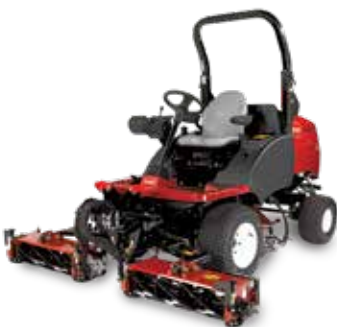
CT2240 - Compact Triple