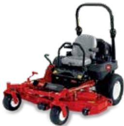
Z Master® Professional 6000 Series

Professional 6000 Series models are enhanced with additional features for smooth and powerful performance, including a robust deck hanging system for a clean cut on hillsides.