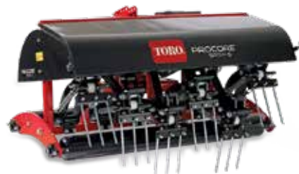
ProCore SR Series Deep-Tine Aerators

The ProCore Processor sweeps, processes and disperses aeration cores in one operation to return the turf to playing condition in less time, with less stress to the turf. The exclusive OnePass hitch also allows you to attach this unit to your three-point aerator to aerate and process cores in one pass.