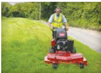
WALK BEHIND / SPECIALTY MOWERS 4-7