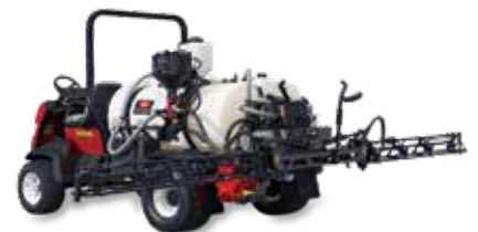
Multi Pro 5800-D

Multi Pro 1750 sprayers are equipped with a positive displacement diaphragm pump tied directly to the speed of the vehicle to maintain a constant application rate at a range of speeds.