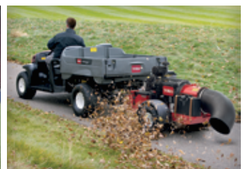
PARTS & SERVICE 26-27