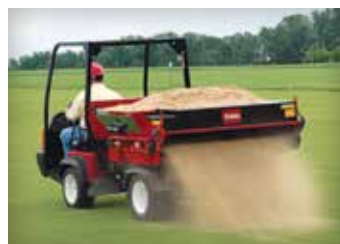
TURF APPLICATION EQUIPMENT & DEBRIS PRODUCTS 22-23