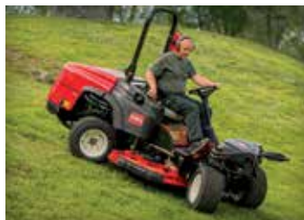
ROTARY MOWERS 10-15