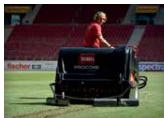
TURF CULTIVATION EQUIPMENT 24-25