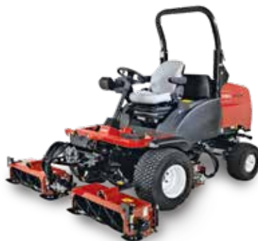
LT3340 - Heavy Duty Triple

The CT2240 reel mower is ideal for areas with restricted access and limited manoeuvrability.