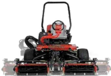
Reelmaster® 3100-D Sidewinder