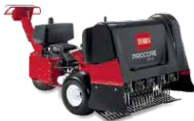
ProCore® 648 Aerator