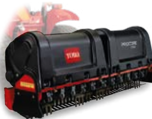
ProCore 864/1298 Aerators