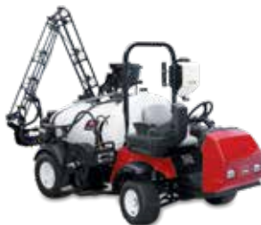
Multi Pro 1750

Multi Pro WM sprayers feature a 757 litre application tank that mounts to your Workman HD utility vehicle. Convert from hauling to accurate, consistent spraying in as little as 30 minutes.