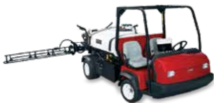
Multi Pro® WM