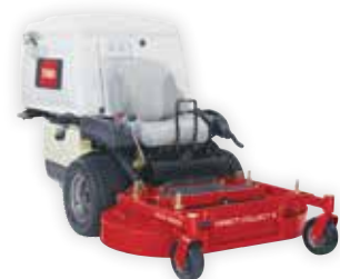
Z Master Professional 8000 Series

Professional 7000 Series mowers deliver extra torque for extreme conditions. Diesel engines and ultra-durable construction make this the choice for your toughest jobs.