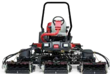
Reelmaster® 3555-D & 3575-D