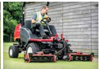
REEL MOWERS / FLAIL MOWER 16-19