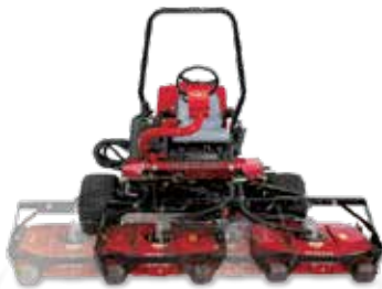
Groundsmaster® 3500-D Sidewinder