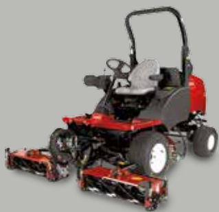
CT2240 - Compact Triple