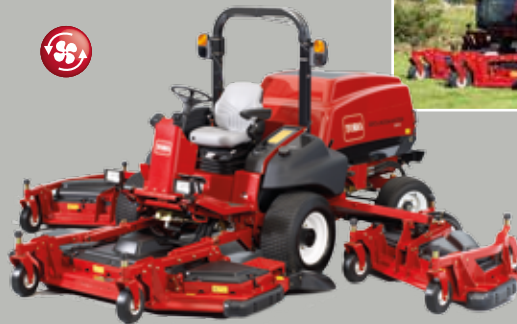
Groundsmaster® 5900 - D/5910 - D

This wide area rotary mower provides 4.9 m productivity while still providing precise manoeuvrability. This durable proven performer can mow up to 8.4 hectares per hour and trim less than an 18 degree circle around trees. The three independent rear discharge cutting units quickly raise or lower on the fly.