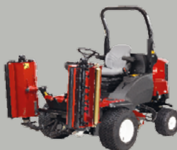
NEW LT-F3000™ - Commercial Triple Flail

Maximize your investment! Through already making an investment in a tractor, why not make this investment work even smarter? Offering the ideal solution to high-output tractor drawn mowing. Available as either the TM5490 or TM7490 with 5 or 7 independent articulating cutter units and numerous reel options, a first class finish results across a broad range of applications, including fairways, polo arenas, municipal parklands, sports fields and educational facilities.