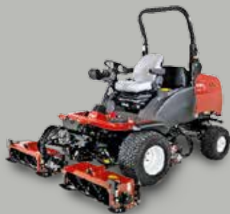
LT3340 - Heavy Duty Triple