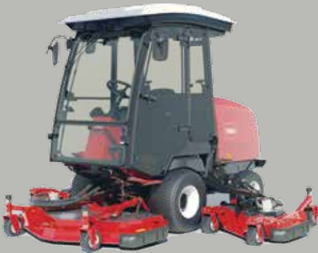
Cab - Groundsmaster® 4010-D/4110 - D

Delivers power where you need it most - to cut grass, no matter how challenging the conditions. With Smart Power™ technology, high engine torque and patented, efficient deck drive systems, these mowers are designed for productivity.