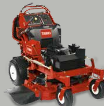
Mid-Size Hydro & Gear models