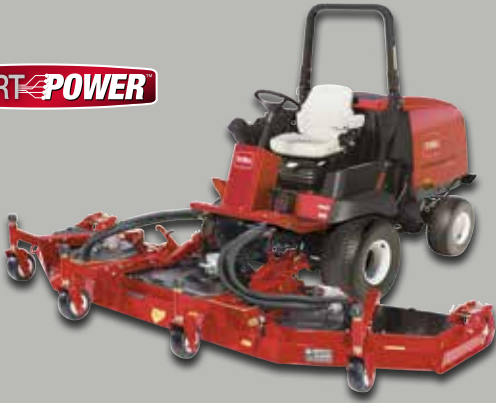
Groundsmaster® 4100 - D

This innovative wide area rotary mower features an all out-front mower deck for superior operator visibility and outstanding productivity. Excellent trimming capability to manoeuvre around obstacles with ease, mow a zero uncut circle, for back and forth patterns leaving no uncut grass. Patented traction system lets you mow with confidence, even on hills and wet grass.