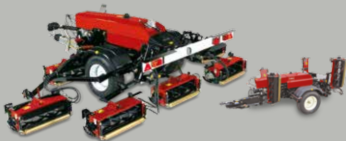
TM5490/7490 - 5 &amp; 7 Unit Reel

The wide-area reel mower designed for heavy-duty mowing operations. With the ability for the operator to use one or all of the five heavy-duty cutting units at any time - providing a cutting width up to 346cm, the T4240 provides superb levels of versatility and flexibility, suiting both large open areas and more confined spaces. Excellent all-round visibility from the operator's seat allows precision operating up to and around obstacles, helping ensure a safer and more productive operation - even with the optional full weather cab fitted.