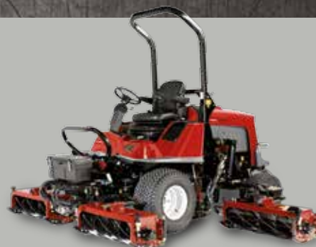
T4240 - Heavy Duty 5 Unit Mower

The CT2240 compact reel mower is designed for operating in areas of restricted access or limited manoeuvrability. It comes with 4-wheel drive transmission as standard, independent cutter head operation and a wide range of cutter reel options. Also features a variable cutting width from 76cm to 212cm to ensure optimum productivity at all times.