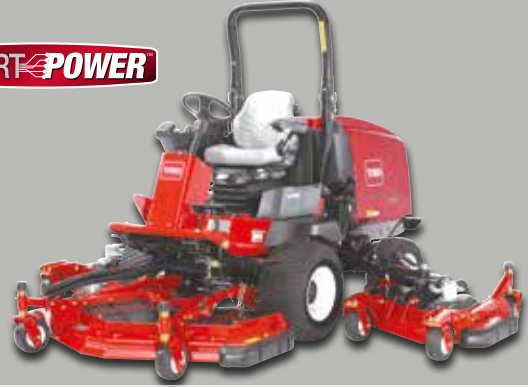
Groundsmaster® 4000 - D

This innovative wide area rotary mower features an all out-front mower deck for superior operator visibility and outstanding productivity. Excellent trimming capability to manoeuvre around obstacles with ease, mow a zero uncut circle, for back and forth patterns leaving no uncut grass. Patented traction system lets you mow with confidence, even on hills and wet grass.