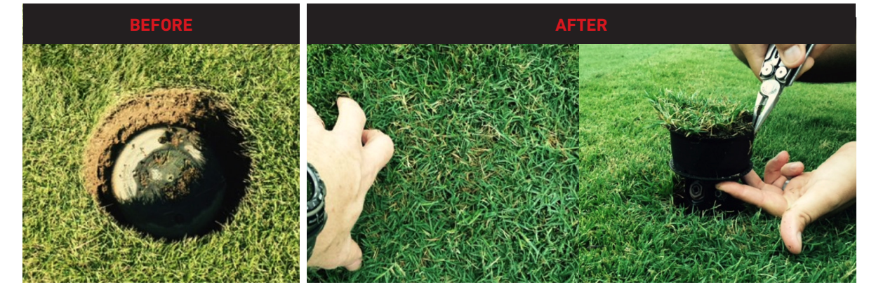
Enhanced appearance and increased efficiency

STEALTH-D – Kit attaches to INFINITY Series sprinklers with dual trajectory main nozzle adjustment capability