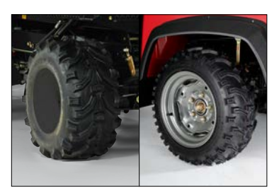
ATV / Snow Tires

Engineered to spread sand and rock salt as well as other deicing materials while boasting even more features to help make your job as smooth and steady as possible