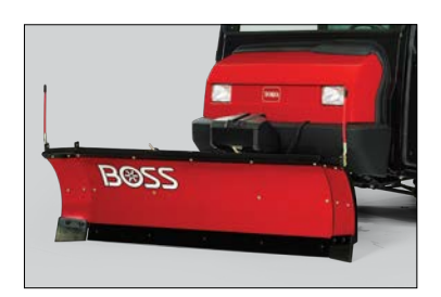
BOSS® Snow Plow

Engineered for your HDX vehicle, yet built to the same professional grade standards as full-size BOSS plows, making them tough enough to handle any snow removal job.