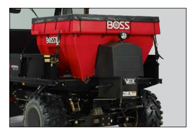
BOSS® V-Box Spreader

Engineered for your HDX vehicle, yet built to the same professional grade standards as full-size BOSS plows, making them tough enough to handle any snow removal job.