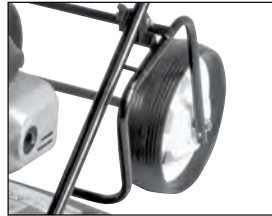
Transport Wheels – maneuver your HoverPro with less effort (450 & 550 models only)