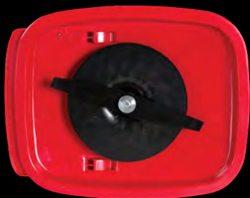
Steel Cutting Blade – (HoverPro 450 & 550)