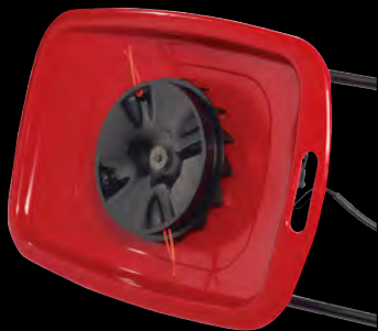
Nylon Wire Cutter – (HoverPro 400)