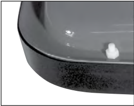
Hi-Rise Kit – bolts to existing deck to increase height of cut by 1.4" (3.5 cm) (400 & 450 models only)