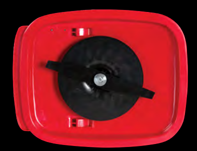
Steel Cutting Blade - (HoverPro 450 & 550)