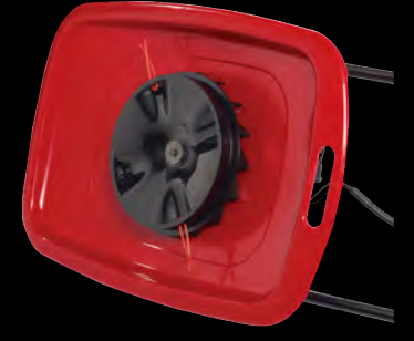
Nylon Wire Cutter - (HoverPro 400)