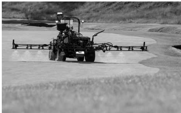
GeoLink's individual nozzle control saves time and money.

RTK: Real Time Kinematic (RTK) satellite correction is a technique used to enhance the precision of position data derived from satellite-based positioning systems, being usable in conjunction with all positioning platforms.