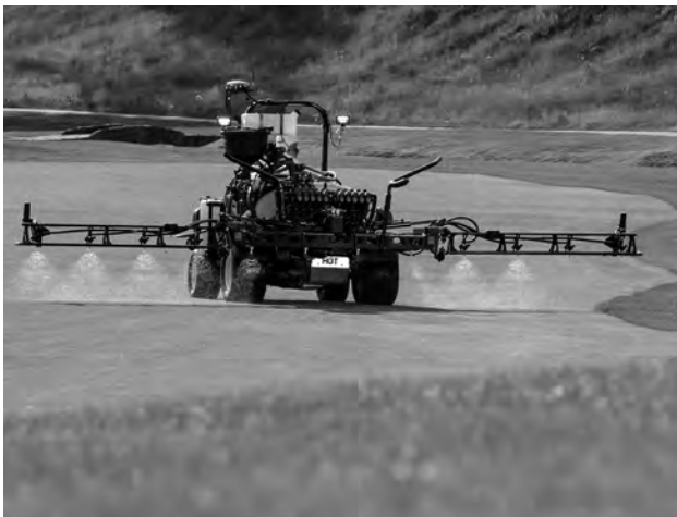
GeoLink's individual nozzle control saves time and money.

RTK: Real Time Kinematic (RTK) satellite correction is a technique used to enhance the precision of position data derived from satellite-based positioning systems, being usable in conjunction with all positioning platforms.