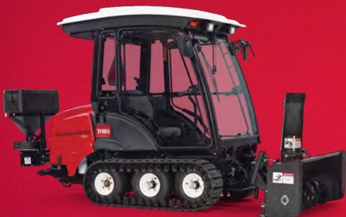
Groundmaster 7210 Polar Trac®