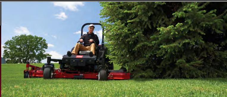
Mowing Deck Options