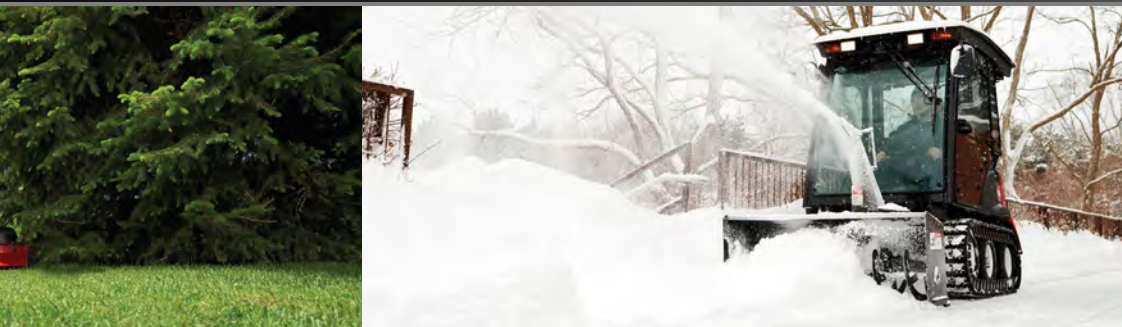
Front QAS Snow Removal (Polar Trac® System)