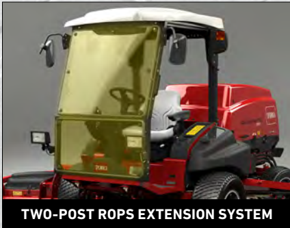
TWO-POST ROPS EXTENSION SYSTEM