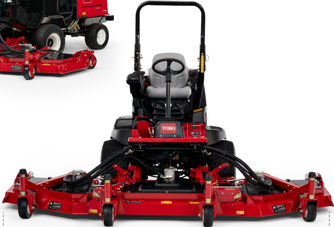
Groundmaster 4100-D has a 10.3' (3.15 m) overall width of cut. Center deck section is 4.5' (1.37 m) with two 3.08' (.9 m) wings and a 7.4' (2.26 m) width of cut with one wing up.

ATTACHMENTS/ACCESSORIES WORK WITH 4000-D, 4010-D, 4100-D & 4110-D MODELS