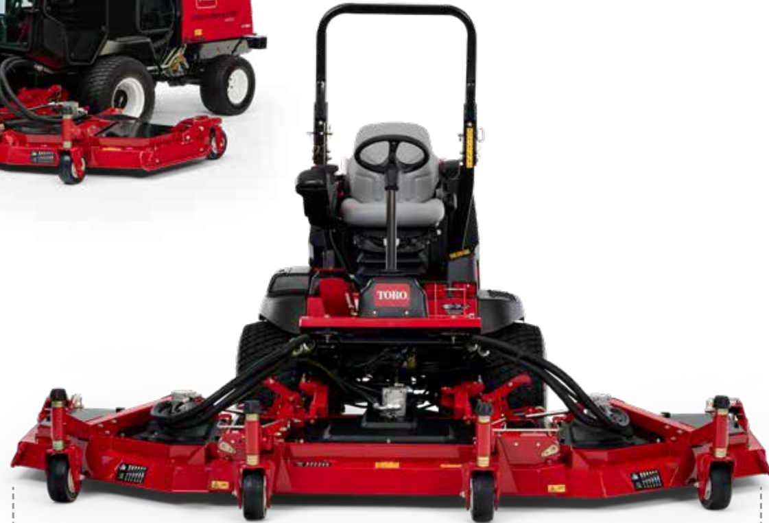
Groundmaster 4100-D has a 10.3' (3.15 m) overall width of cut. Center deck section is 4.5' (1.37 m) with two 3.08' (.9 m) wings and a 7.4' (2.26 m) width of cut with one wing up.

ATTACHMENTS/ACCESSORIES WORK WITH 4000-D, 4010-D, 4100-D & 4110-D MODELS