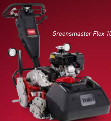
Greensmaster Flex 1018/1021