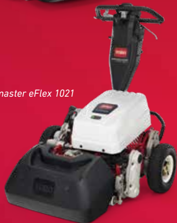
Greensmaster eFlex 1021