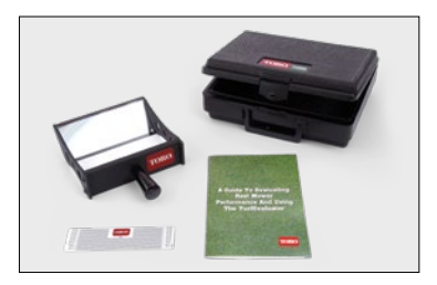
Turf Evaluator • Mirror device used to assess turf conditions