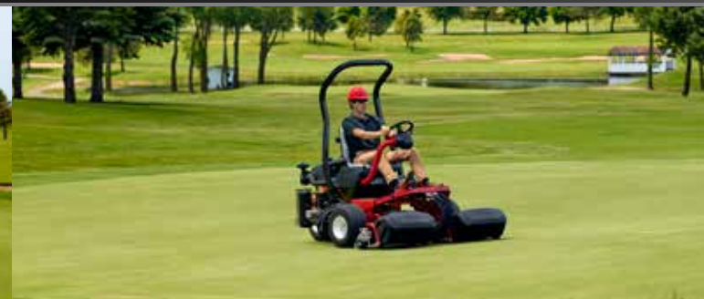
Traction Unit Accessories