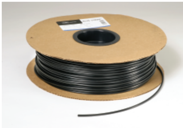
Part no. EVR0332-250

Toro Ag Irrigation 1588 N. Marshall Avenue, El Cajon, CA 92020-1523, USA Tel: +1 (800) 333-8125 or +1 (619) 562-2950 Fax: +1 (800) 892-1822 or +1 (619) 258-9973